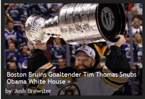
Boston Bruins Goaltender Tim Thomas Snubs Obama White House »